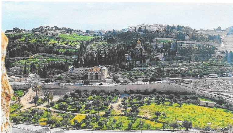
Mount of Olives, Jerusalem. Photo taken from atop of Eastern Gate on the Temple Mount. In View: Dominus Fleuit Chapel; Church of All Nations/Basilica of the Agony; Russian Orthodox Church of Mary Magdalene; and the traditional site of Gethsemane

Head covered, barefoot and weeping, King David climbed the Mount of Olives in hurried flight. The Kingdom was in turmoil. His son had led a rebellion against him. Government officials had betrayed him. Friends had become traitors, and David and his family were on the run. Leaving the comfort and protection of Jerusalem, David would once again find himself headed toward the wilderness (2 Samuel 15-16), ascending a hill that would one day become a mountain of tears.